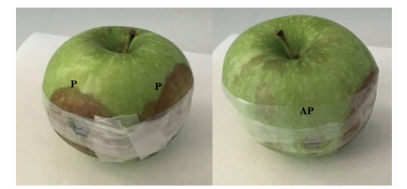
Figure 2. Apple fruits inoculated with P; Fusarium proliferatum and AP; agar plug

The isolate from protea plants showing wilting symptoms investigated pathogenesis against apple fruit in the laboratory conditions. According to the pathogenicity test results, fruit rot was observed on apple fruits inoculated with mycelium plugs of Fusarium, on the other hand no symptoms were observed on negative control (Figure 2). The fungus was re-isolated and its morphologic characteristics in accordance with the same culture of F. incarnatum were isolated from this study.