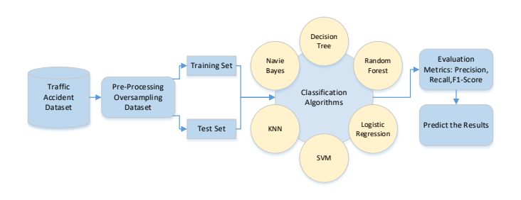
Figure 1. Developed model using various classification algorithms

accidents and identifying various risk factors (Santos et al. 2022).