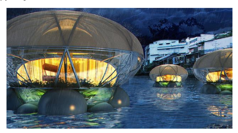
Fig. 6. Jellyfish Lodge [28].

- Jellyfish Lodge: A unique concept project inspired by nature. This house (Fig. 6) is inspired by the ability of special cells in jellyfish bodies to convert solar energy directly into electricity. This extraordinary structure, also known as Jellyfish Lodge, is not only aesthetically pleasing but also functional.