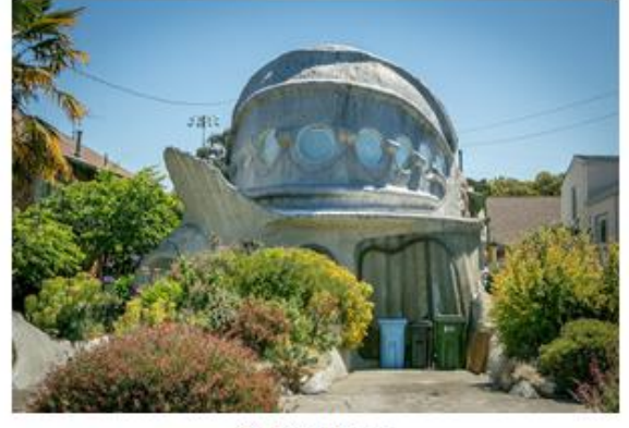
(b) Fish House