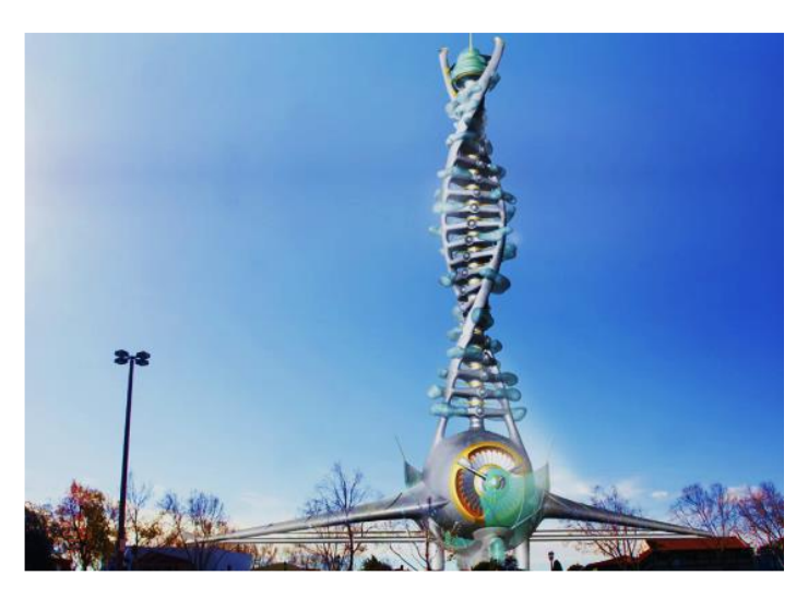
Fig. 3. Eugene Tsui's DNA-like tower design for a business and public building [24].

-San Leandro Civic Center: Another design that Tsui created with micromorphic formation is the "San Leandro Civic Center" building he designed in 2014 (Fig. 3).