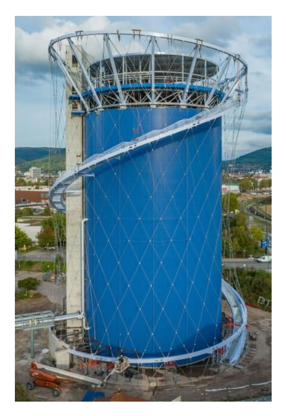
Fig. 4. Energy Storage Center (Stadtwerke Heidelberg-Model) (Germany) [25].

-LAVA-Energy Storage Center: It is a cylindrical structure that functions as a public sustainable energy information center (Fig. 4).