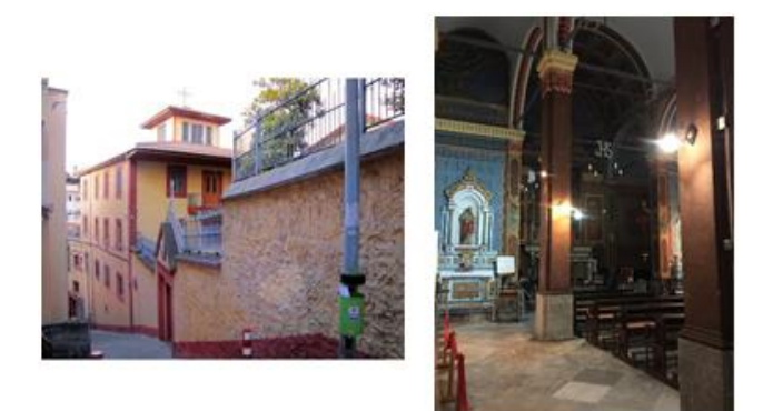
Figure 1. Santa Maria Church.

In this study, Santa Maria Church (Figure 1) which is about 150 years old was studied. The damage and defects in the Santa Maria Church were determined by nondestructive test devices including Resistograph and FAKOPP Screw withdrawal resistance meter. In addition, screw holding, shear and elasticity modulus of the wooden beams in the structure were determined.