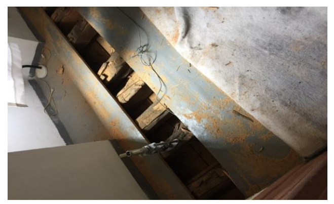
Figure 2. The beams in Santa Maria Church were tested using screw withdrawal resistance meter.

Screw withdrawal resistance meter: The beams in Santa Maria Church were tested using screw withdrawal resistance meter (Figure 2). Screw withdrawal force is an indicator of the wood material strength, density and shear modulus. Fakopp Enterprise developed a portable screw withdrawal force meter. The applied screw diameter is 4mm, the length of the thread is 18 mm. The screw withdrawal force is a local parameter but selecting a representative location on a beam it is a useful information in wooden structure evaluation (Fakopp Enterprise, 2010).