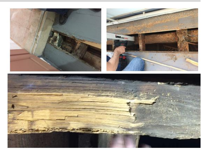
Figure 3. Evaluation of the beams by Resistograph.

Screw withdrawal resistance results: The wooden beams in 15 rooms of the Santa Maria Church were evaluated by Screw withdrawal resistance meter in order to determine screw withdrawal resistance, modulus of rupture (MOR) and shear resistance. Screw withdrawal resistance, MOR and shear resistance of the beams are given in Table 1.