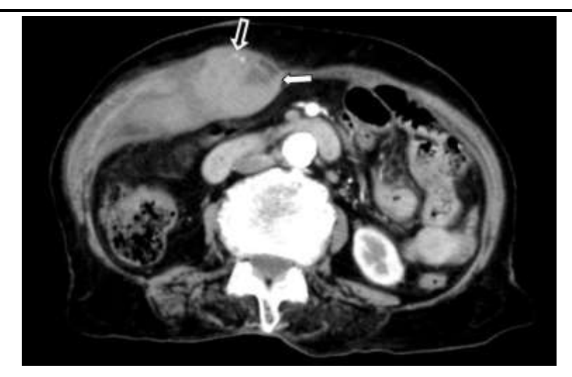
Figure 1. Hematoma in the right rectus muscle on contrastenhanced abdominal CT of a 91-year-old female patient using warfarin for mitral valve replacement. Also, fluid cellular levels (arrow) and contrast extravasation suggesting active bleeding (hollow arrow) are present

For statistical analysis, SPSS Statistics Software v.21.0 (IBM Corp. Release 2012. IBM SPSS Statistics for Windows, Version 21.0. Armonk, NY.) was used. Categorical data were expressed as numbers and percentages; Categorical variables were compared with the chi-square test and numerical values with Mann-Whitney U test. P<0.05 was considered statistically significant.