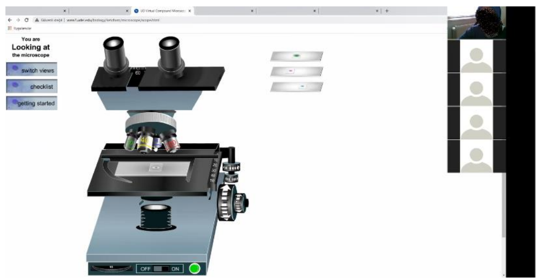
Figure 1. Virtual laboratory activity (https://www1.udel.edu/biology/ketcham/microscope/scope.html)