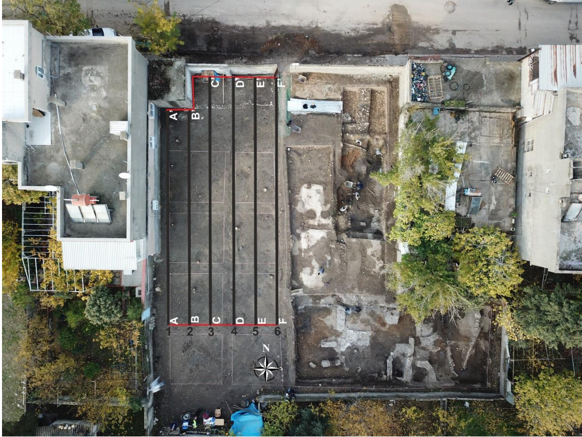
Figure 3. Survey Plan of GPR Profiles.

GPR measurements were carried out to determine the nature of the mosaic-based structure on block-445, which were previously unearthed through illegal excavations, and the parcels it extends to (Figure 3). GPR measurements were performed along 6 profiles with 1 m interval. The measurements taken were evaluated in the reflexw software and made ready for interpretation by applying the data processing steps including dewow, time-zero correction, bandpass filtering, average subtraction, and f-k-migration given in Table 1.