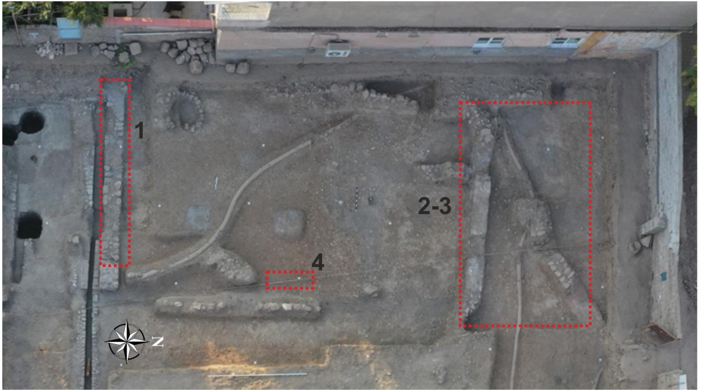
Figure 6. Archaeological Remains Unearthed as A Result of Excavation.

determine the borders and structures of the ancient city Caesarea Germanicia exactly with the archaeological excavations.