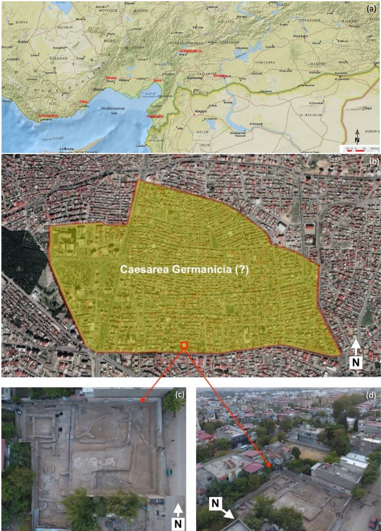
Figure 1. (a) Caesarea Germanica (?)'s Location in the Eastern Mediterranean, (b) Caesarea Germanica (?) 3rd Degree Archaeological Site Boundary, (c) and (d) Detail Photos from the Roman Bath (modified from Ok and Dumankaya, 2022).