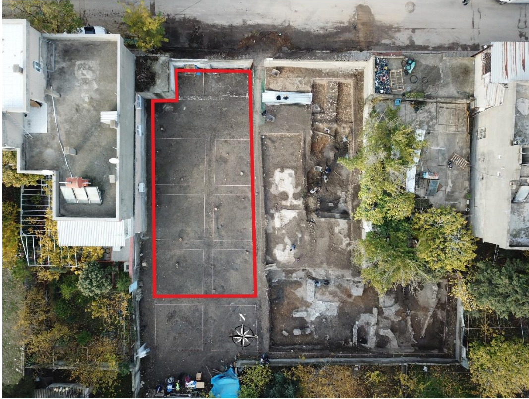
Figure 2. Area of Ground Penetration Radar Study.

Archaeogeophysical studies carried out in the above-mentioned various ancient cities and settlements have made significant contributions to the determination of archaeological cultures before archaeological excavations and have enabled significant savings in both time and excavation costs. In the same direction, this study was carried out in order to investigate the possible presence of remains in the study area, which is thought to be the remains of the ancient city of Caesarea Germanicia, and thus to decide whether to carry out excavations before the long and costly excavations.