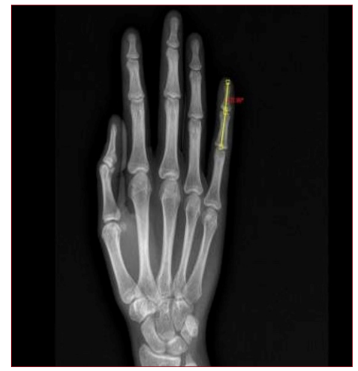
Figure 1b: The picture shows the measurement technique of the angulation of fifth finger by using the X-ray (b).

Descriptive statistics, comprising mean, standard deviation, median, minimum and maximum values, frequency, and ratio values, were utilized to summarize the data. The distribution of variables was assessed using the Kolmogorov-Smirnov test. The analysis of quantitative independent data was performed using the Mann-Whitney U test, while the Chi-square test was employed for the analysis of qualitative independent data. Statistical analysis was carried out using the SPSS (Statistical Package for the Social Sciences, IBM, New York<sup>®</sup>, NY) version 26.0 program.