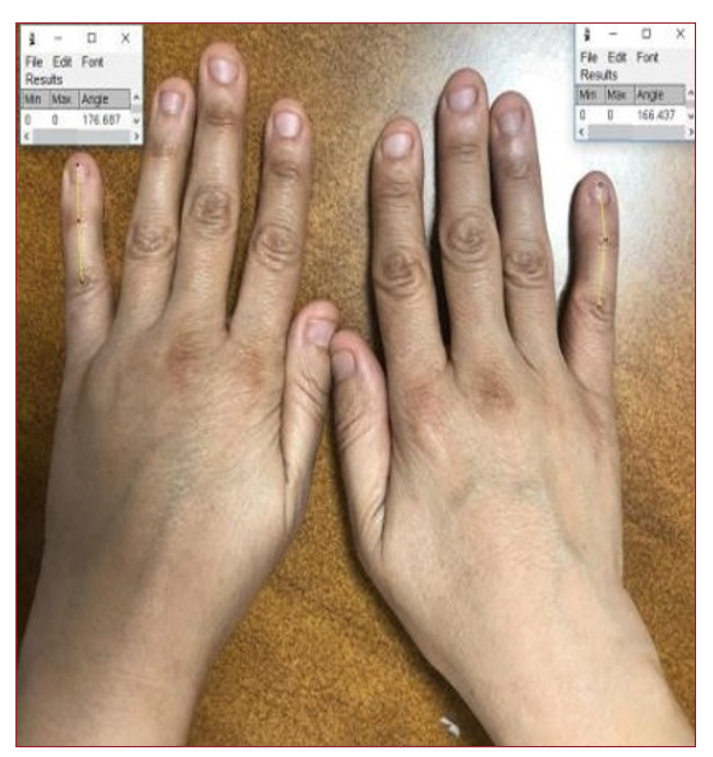
Figure 1a: The picture shows the measurement technique of the angulation of fifth finger by using the photo (a).