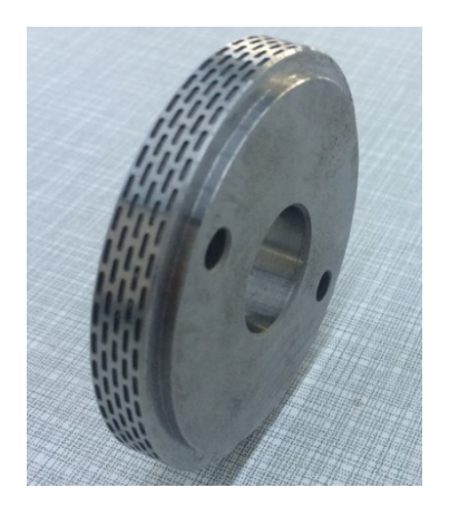
Figure 1. The roller used in the study.

All of the sewn fabrics were washed at 30°C with synthetic washing programme without prewashing according to TS EN ISO 6330:2012 test standard. 4 g/l ECE nonphosphate reference detergent without optical brightening agent was used for washing processes. Washing process was repeated for five times.